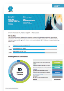
ZDHC Performance InCheck Report

Intertek is capable of performing Verified InCheck Level 1 to review the overall completeness and accuracy of the chemical products in a supplier's chemical inventory against those published in the ZDHC Gateway – Chemical Module. This enhances confidence in the Performance InCheck Reports generated by a supplier.